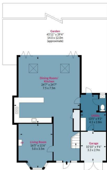
Ground Floor Floor Area 1029 Sq Ft - 95.59 Sq M (Excluding Garage)